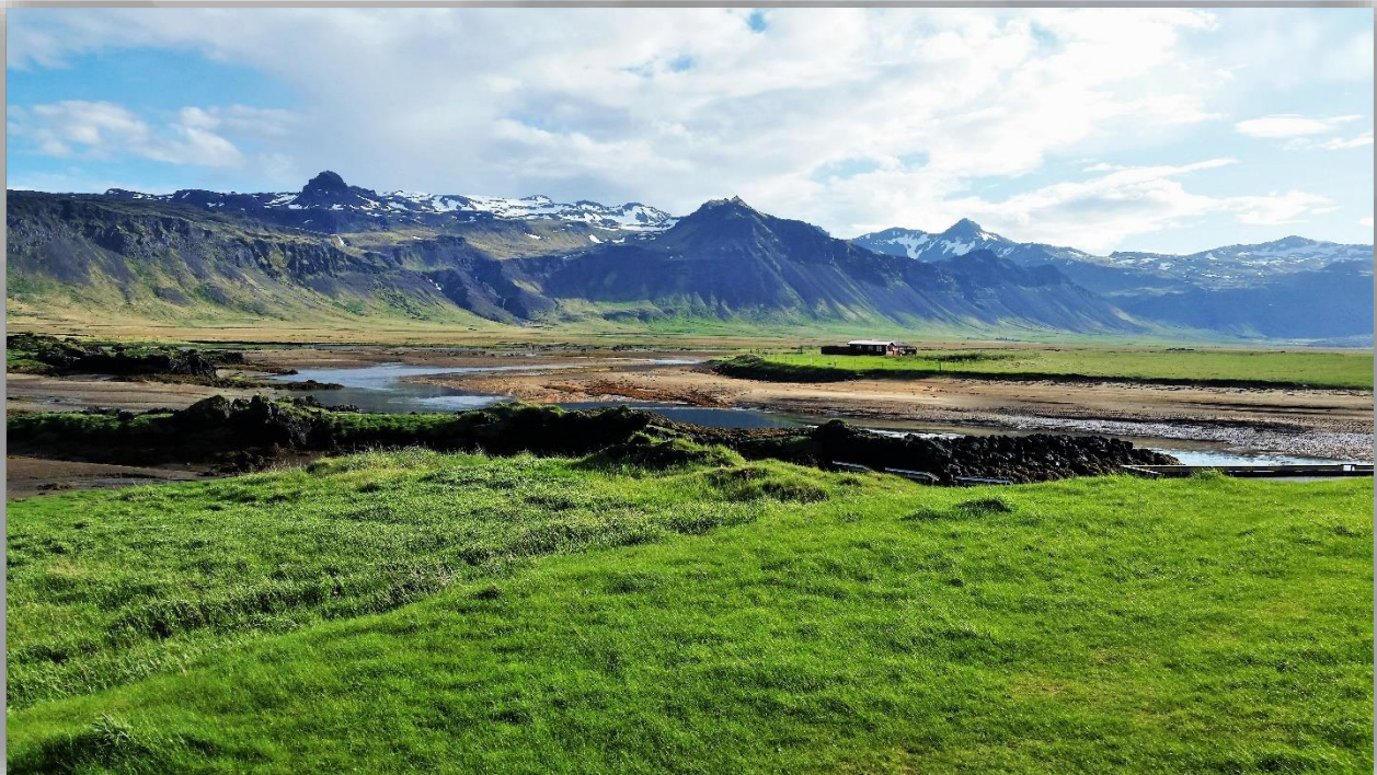
The glorious view from Hotel Budir

Arrival this morning into Keflavik – You will be met at the airport by Michael and fellow staff just outside baggage claim once through customs & immigration. Depending upon your respective arrival time, we will either transfer into Reykjavik city center or with the main group to the Hotel Budir on the western Peninsula. Settle in, relax, enjoy a walk or short hike around the area. Pending the group arrival time, we may have brief sightseeing plans for today or simply relaxing on the hotel grounds. This evening Introduce and reacquaint yourself with your fellow travelers at the welcome reception and included dinner this evening. We are here at Hotel Budir for 2 nights (R, D)