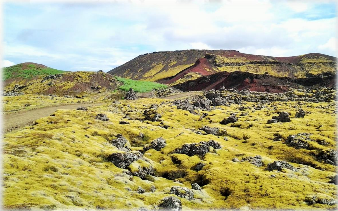
A soft mattress-like bed of moss grows on lava fields