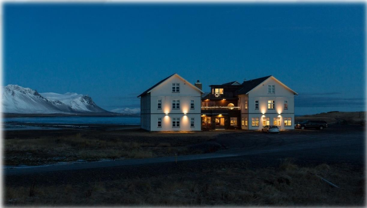
Hotel Budir – Western Peninsula