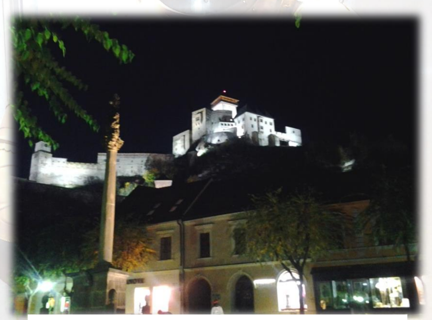
Trencin Castle keeping vigil over the heart of the Slovakian city

This is a big day as we drive into the beautiful Carpathian & low Tatra Mountains in Northern Slovakia headed to the Orava Valley. Orava holds one of Slovakia's national treasures; Orava Castle towering above the valley. Built on top of a wooden fortification in 1241, the original purpose was to ward off the Mongol and Tartar invasions in their attempt at conquering the Hungarian Empire in the 13<sup>th</sup> Century. Many scenes of the 1922 film; Nosferatu were shot here. When you conjure images of mysterious and medieval castles, Orava is a classic. We'll tour through the majority of this amazing multi-level fortress. Enjoy a lovely lunch in a traditional Slovak restaurant prior to touring. This evening, after returning to Trencin, enjoy a group dinner above the city at Trencin Castle. If you're a fan of medieval sights and history, today is your day. B, L, D