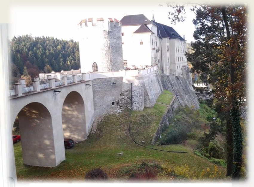
One of many great medieval sites to see close to Prague