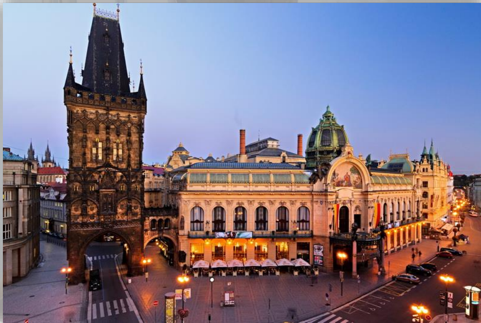
Powder Tower & Prague Municipal House