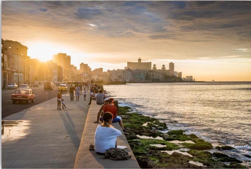
The Malecón, Havana's 8km-long sea drive, is one of the city's most soulful and quintessentially Cuban thoroughfares