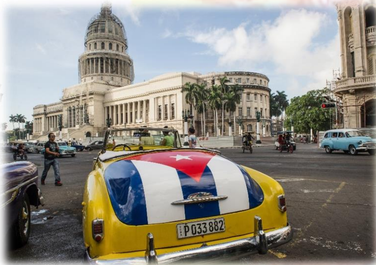
Cuban patriotic car