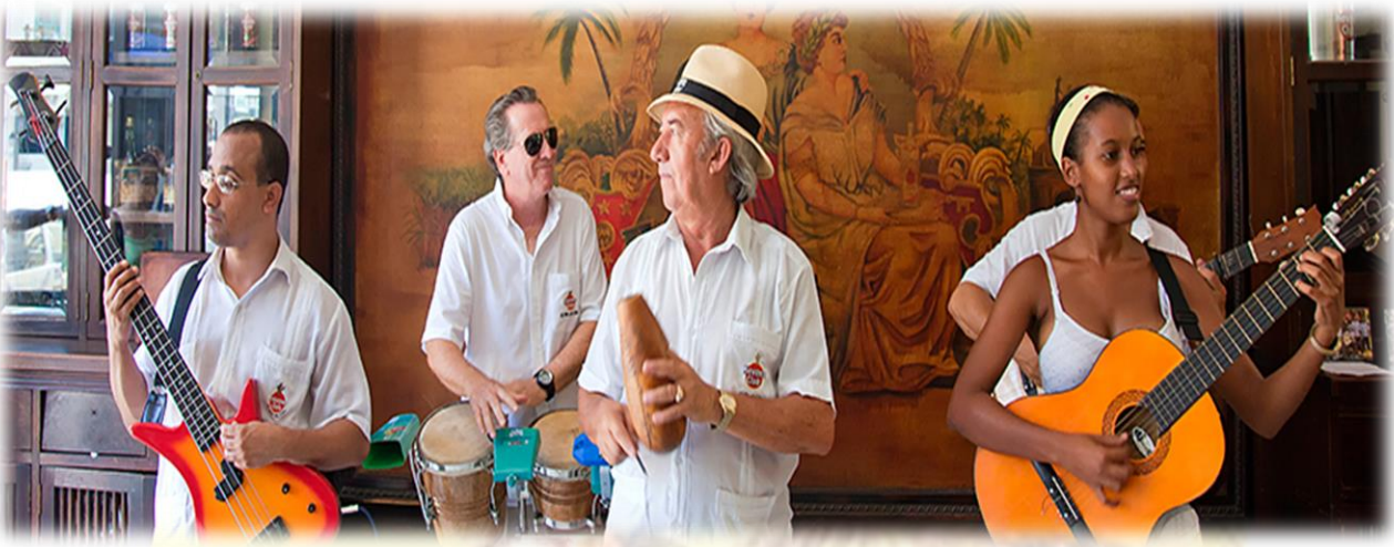
Typical Cuban musicians