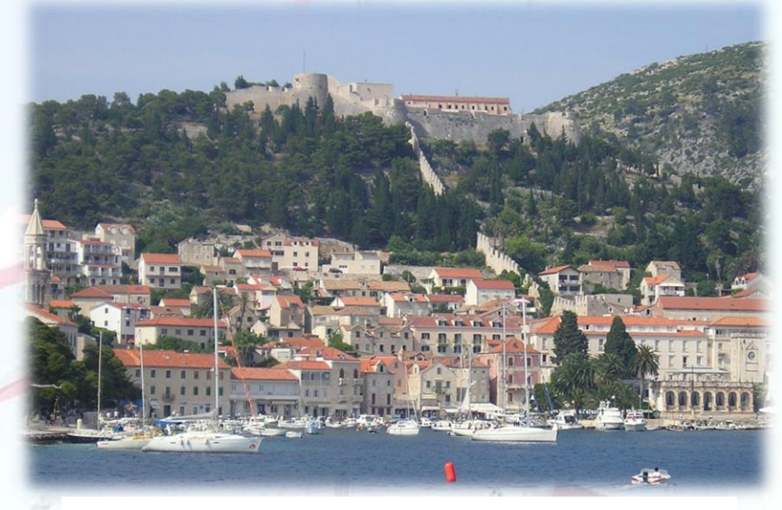
The imposing Venetian fortress overlooks the promenade on Hvar

As you awake this morning the S/Y Barbara sails for the island of Hvar just across the short straights. Wander & tour the quaint streets of this island village known for its harvesting of Lavender. Hvar is a getaway for many Croats as well as Europeans as you'll see on the small promenade full of luxury yachts. Perhaps you'd like to get away and hike up to the medieval Venetian Fortress overlooking the village. A short guided city tour is included on the island visiting a few of the village highlights. A leisurely day in this small island village is a sheer joy. (B, L, D)