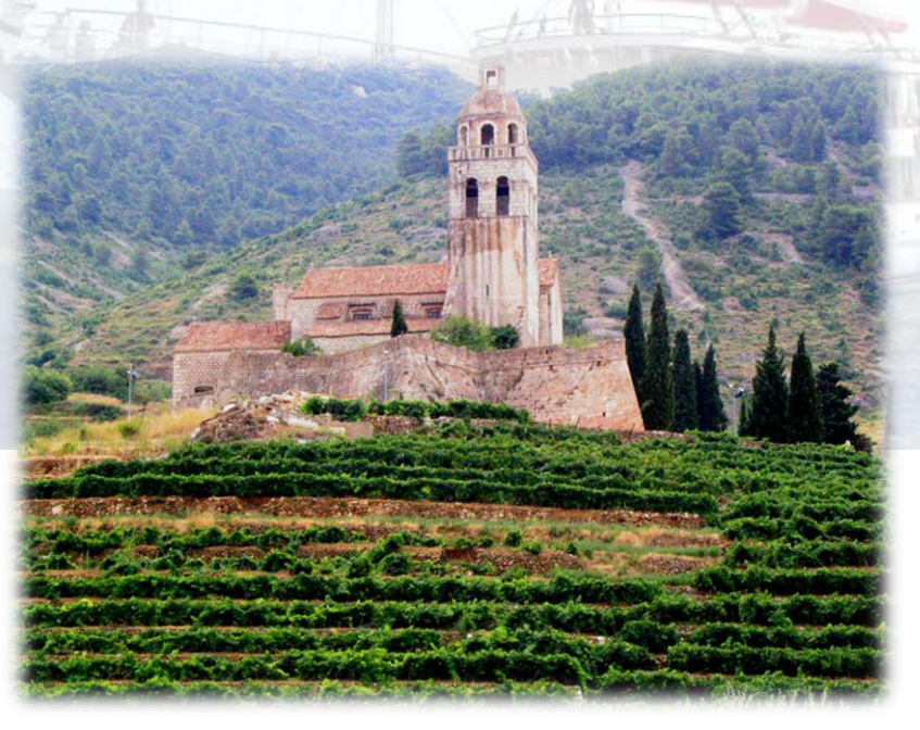
One of many historic medieval sites to be seen on Vis

Midway through the cruise, we sail to the small Island of Vis and the village of Komiza, only open to tourists since 1989. Vis has historic significance dating to the 4th century BC including a strategic military outpost in WWII for Marshal Tito. Stroll the historic streets of Komiza, a famous fishing village. Take time and enjoy a fresh seafood and Lobster lunch on your own in one of many great restaurants by the sea. Enjoy a short walking tour of Komiza and experience firsthand the uniqueness and beauty of this quaint & small island. A great leisurely day here is an easy task. Dinner is served on board this evening. (B, D)