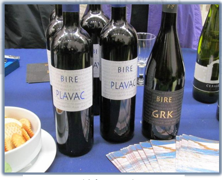
Experience Korcula's finest award winning wine