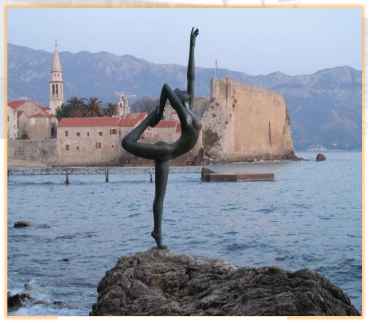
Budva on the Adriatic mixes old & new