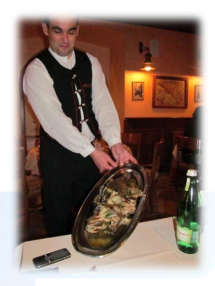
Bon Apatite or "Dobre Tek"