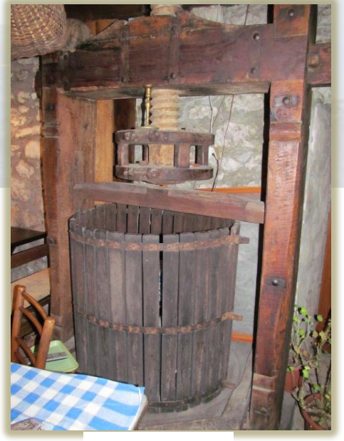
Back in the day

This evening we sail to the island of Mljet, across the peninsula straights with time to enjoy an evening walk on the small island and take a stroll through the small port of Pomena. Dinner is on board this evening. (B, L, D)