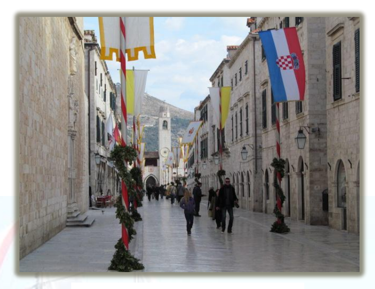
Dubrovnik's main street "Placa"